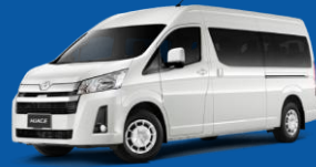
Toyota Hiace 2024