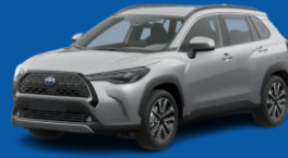
Toyota Corolla Cross Hybrid 2024