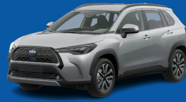
Toyota Corolla Cross Hybrid 2024