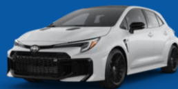
TOYOTA GR COROLLA 2025