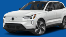
VOLVO EX90 2025