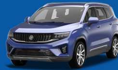
PROTON X90 2026